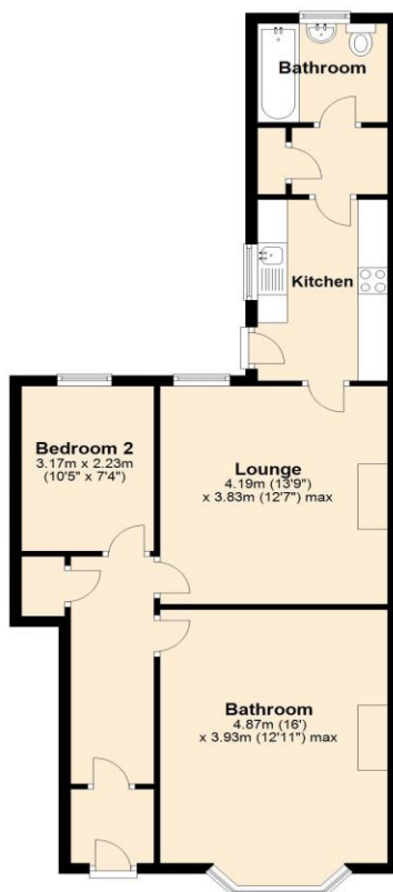
Ground Floor Approx. 68.5 sq. metres (737.7 sq. feet)

Total area: approx. 68.5 sq. metres (737.7 sq. feet)